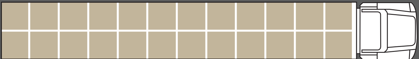
Truck Loaded with EVERGREEN Generators

When resources are stretched thin, EVERGREEN is better suited to respond to emergency situations by using less trucks to move the power where it's needed. Add the water heating capabilities and quick change electrical panel features, and once again the EVERGREEN is the best (and greenest) machine for the task.