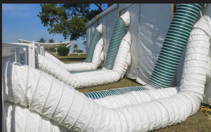
Traditional Ducting (Very Messy)